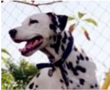
Lexus, Save the Dals' first rescue Dal

Save the Dalmatians and Others Canine Rescue, Inc. is a 501(c)(3) non-profit, tax-exempt organization dedicated to the rescue of Dalmatians from shelters, the promotion of adoptions of shelter Dalmatians and education of the public about the Dalmatian breed. We were founded in 1996 and became incorporated in 1998.